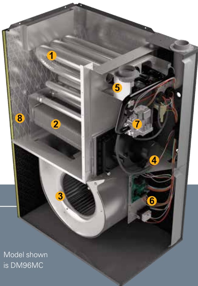
Model shown is DM96MC